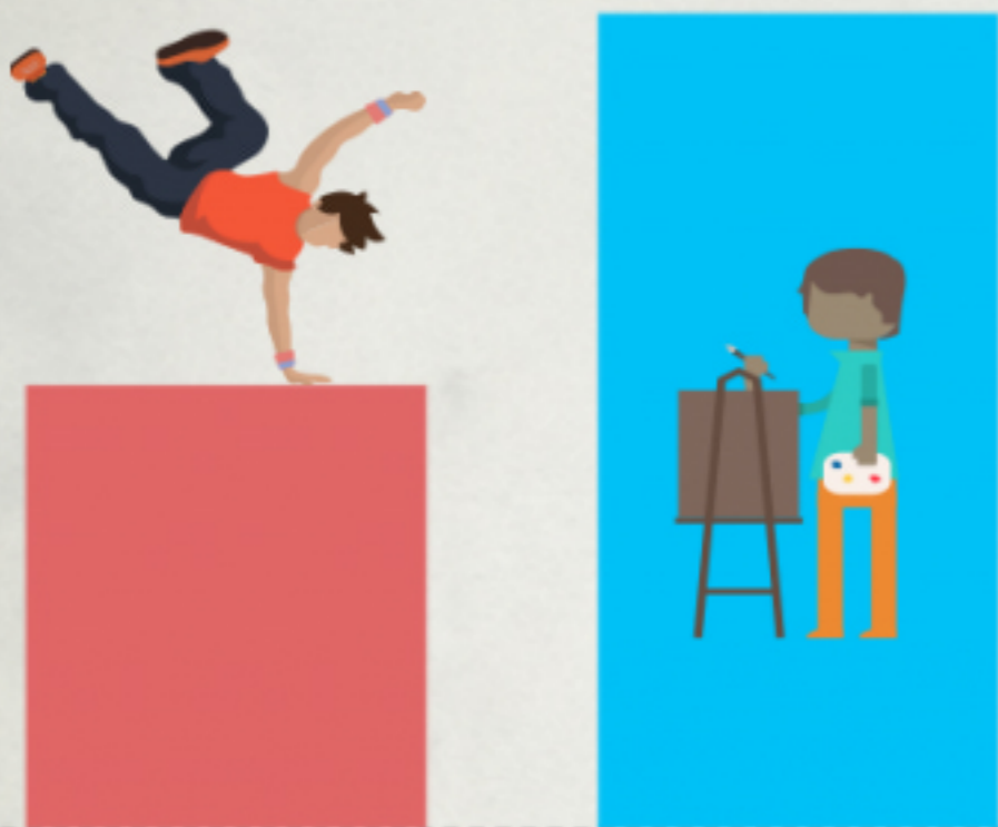
Growth 1982 - 1992